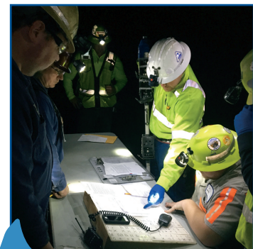
4 MINE RESCUE TRAINING