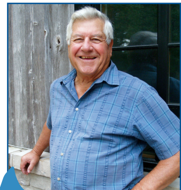
3 COMMUNITY ADVISORY PANEL