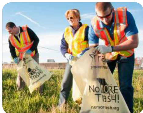
MoDOT volunteers help by picking up trash along adopted highway segments. MLC's VMV Committee in Ste. Genevieve is involved with these activities each year.

Since 1987, Missouri's Adopt-A-Highway program has involved volunteers across the state working together to clean up Missouri. MoDOT